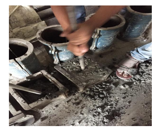
Figure10: Slump test for RCA variations