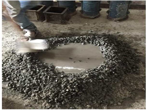
Figure7: - Mixing of materials ijesird, Vol. III, Issue X, April 2017/659