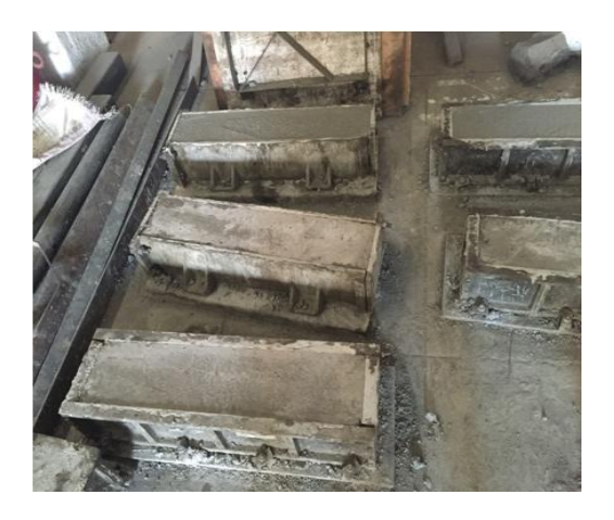
Figure8: - Casting of Cubes