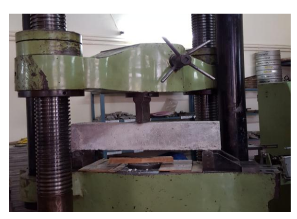
Figure 14: Flexural Test of Concrete