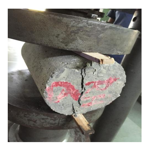
Figure 13: Split Tensile Test of Concrete