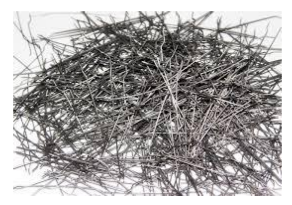
Figure 4: Steel fibers with hooked ends

Many types of steel fibers are used for concrete reinforcement. Round fibers are the most common type and their diameter ranges from 0.25 to 0.75 mm. Rectangular steel fibers are usually 0.25 mm thick, although 0.3 to 0.5 mm wires have been used in India. Deformed fibers in the form of a bundle are also used. The main advantage of deformed fibers is their ability to distribute uniformly within the matrix. Fibers are comparatively expensive and this has limited their use to some extent.