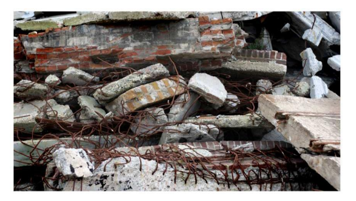
Figure 2:Old concrete and other building materials

Various studies have been carried out on Recycled concrete aggregates, but it has been seen that the mechanical properties of the obtained concrete by these aggregates are worse than the common concrete. Also the desired strength could not be obtained after various percentages of replacementsie. 50%, 60%, 70%, and to mitigate the poor performance we haveused 1% steel fibers with recycled concrete aggregates. Thus, our aim is to study the properties of recycled concrete aggregate, reinforced with hooked up steel fibers.