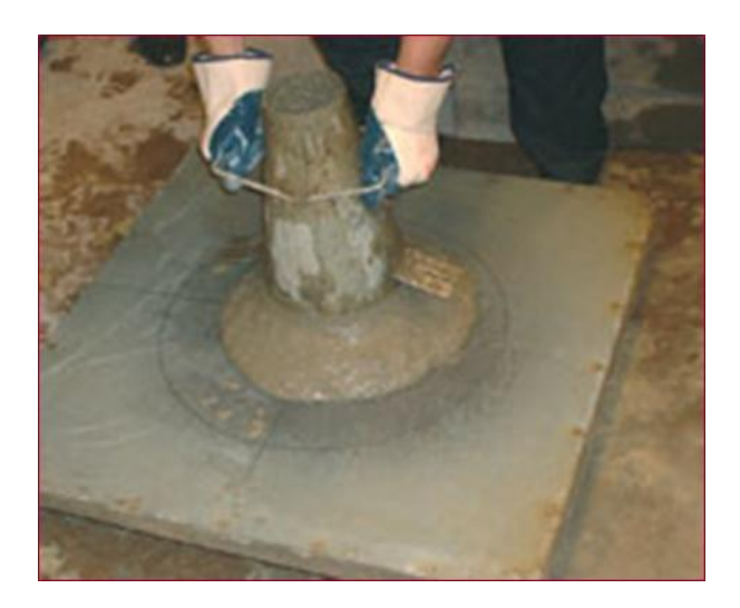
Figure9: - Casting of Beams