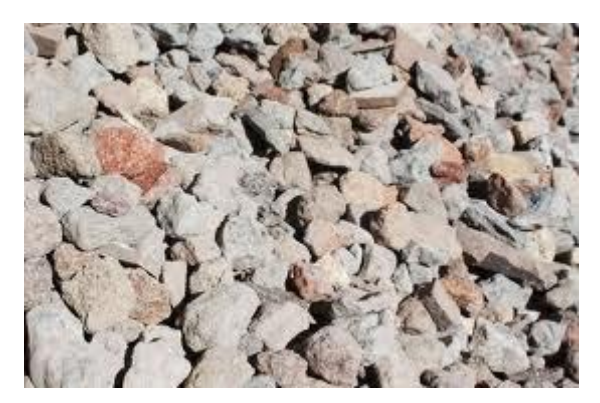
Figure 3: Obtaining Recycled Concrete Aggregates by crushing the Conventional Concrete