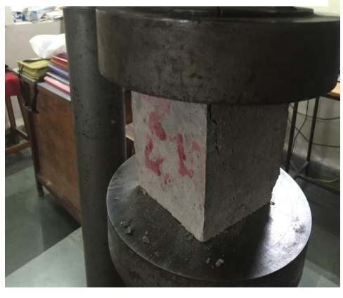
Figure 11: Compressive Strength of Concrete