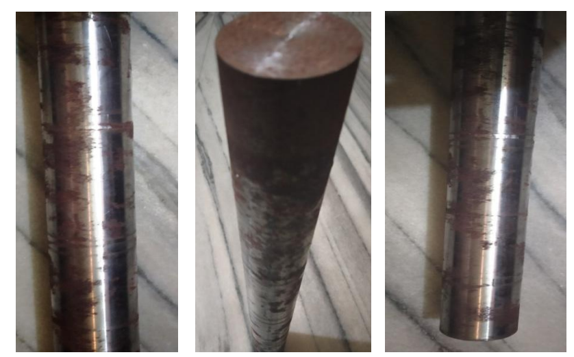
Figure 2: Samples after heat treatment.

obtain is compared to conclude effect of heat treatment on mechanical properties. Heat treatment was performed in Electrical Muffle furnace at the predetermined temperature range as per sample material phase diagram & process parameters.