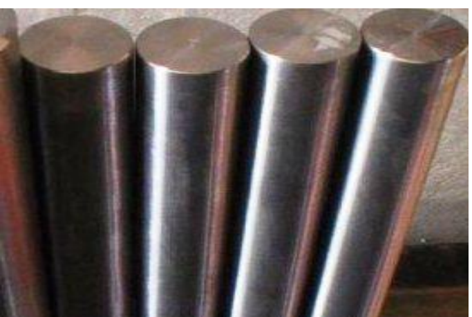
Figure 1: Low alloy steel specimens before heat treatment.

Material: Low alloy steel rod was used as specimen (Purchased from local market) for present work. Dimensions of shaft shape specimen were Dia. x length = 16 mm x 140 mm, with ultimate tensile strength 900 MPa and yield tensile strength 670 MPa , elongation 15 % (Max.), yield stress (0.2%) = 672 MPa, Hardness (Rockwell)= 30 HRC.